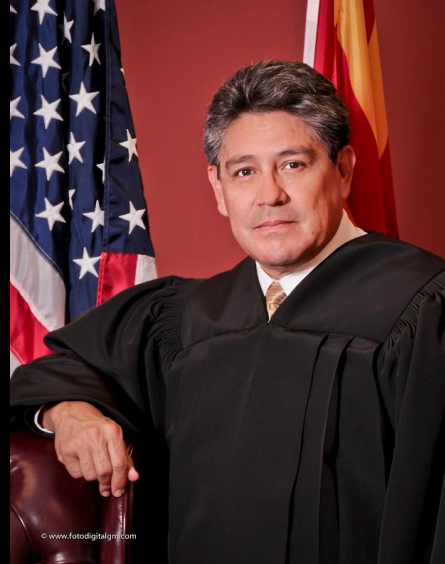
Judge Juan Manuel Guerrero Justice of the Peace, Precinct #2

Judge Guerrero was elected on November 4, 2014, as Justice of the Peace, Precinct #2, and took office on January 1, 2015.