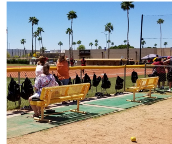
Inductees enjoying the AWC softball game.