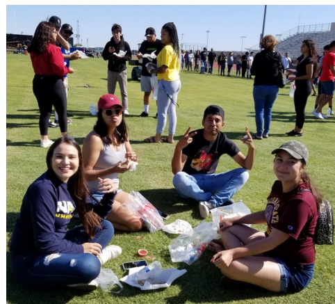
AWC, ASU, NAU, and UofA graduates enjoy their breakfast after their rehearsal.

Help support higher education and make an impact on our community!