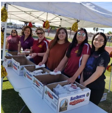
AWC Alumni volunteers serving Chili Pepper burritos to the graduates.